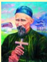
Missionary to China

“Becoming a missionary is not a sacrifice I am making to God. It is a grace He is offering me.”