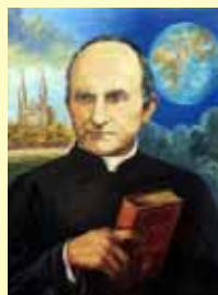
Founder - SVD

"Internship" is another such programme for third year collegians which deals with work experience