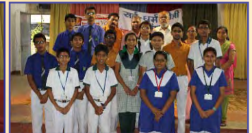
Essay Competition at MDS School on 19.08.2014