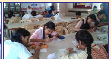
Fancy Dress Competition at St. Anthony's Sr. Sec. School on 09.08.2014