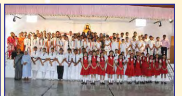
Inter School Patriotic Dance Competition and Prize Distribution Ceremony at Sukhadiya University Auditorium on 23.08.2014