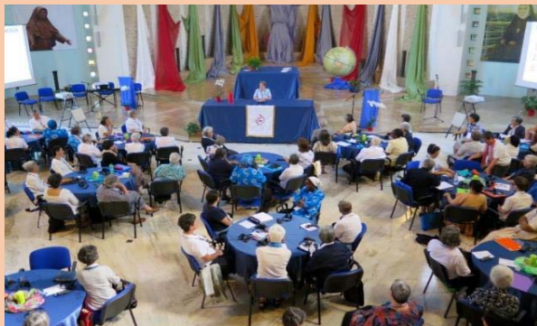
Session during a General Chapter