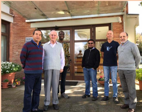
Centro Ad Gentes Intercultural Community Team. Vietnam/England/Ghana/Indonesia/Australia/Chile