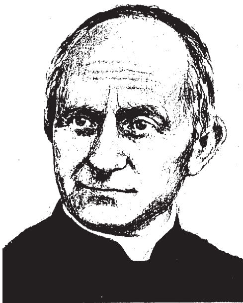
St. Arnold Janssen