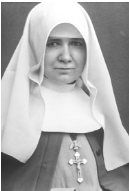
Bl. Maria Helena Stollenwerk