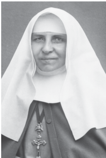
Bl. Josepha H. Stenmanns