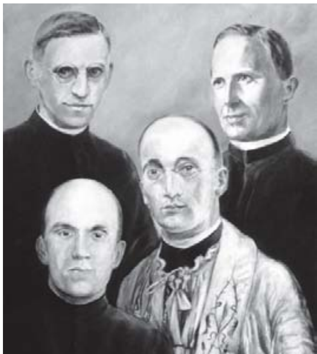
Bl. Louis Mzyk