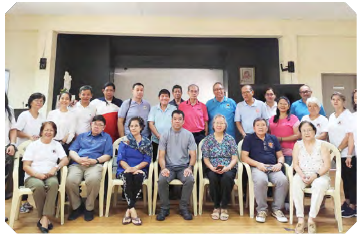
Trinitarian Lay Mission Spirituality