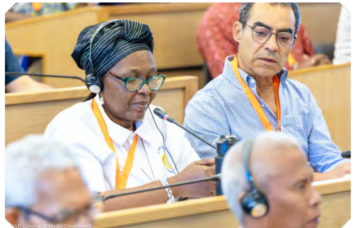
SVD Generale, Medisk Department