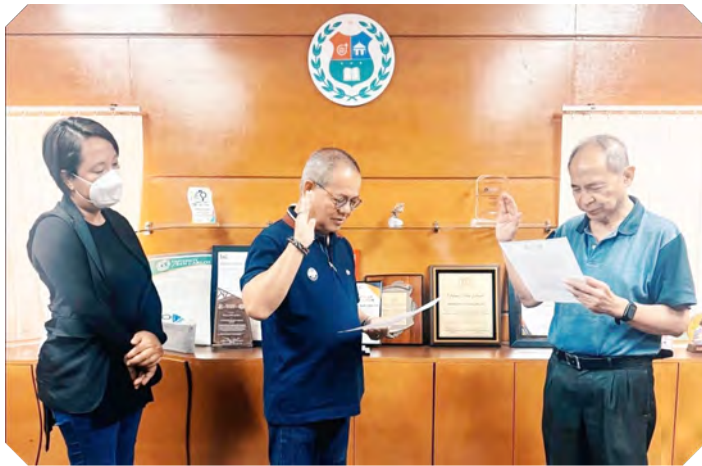
Officers and Members of the Board of Trustees Take Oath